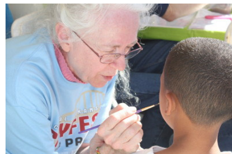
Painting faces at Little Rock crusade.

Since I am already half way across the continent, I will be visiting my children, grandchildren and great-grandchild on the East coast before coming home. I should return to Edmonton approximately December 1st and look forward to seeing many of you then.