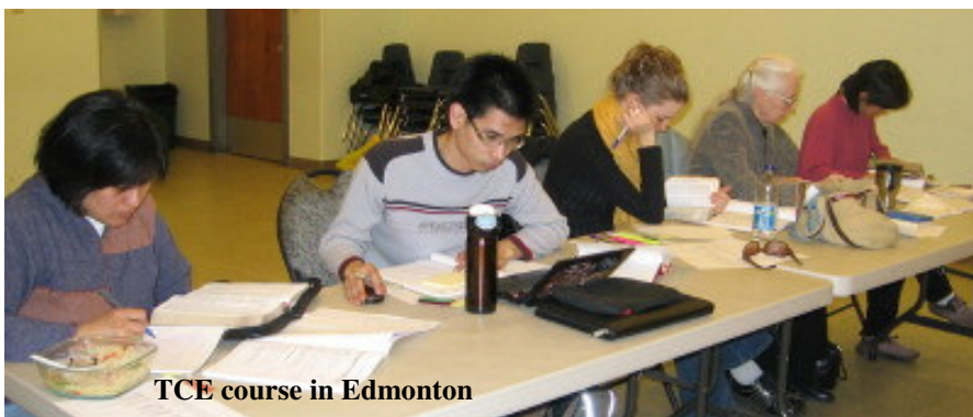
TCE course in Edmonton

Travel —I am taking a vacation during November, ending it in Montreal, where I will be meeting with representatives from most of the other provinces to plan the curriculum for next summer. I hope to also take the rest of my vacation time in December, in between meetings and other work that needs to be done at the office. Please pray that I will get the rest I need and be refreshed for next year's ministry.